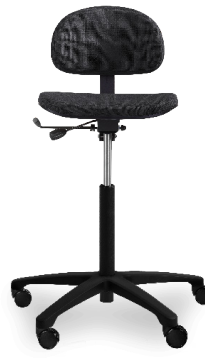
RH SUPPORT LIMPAN