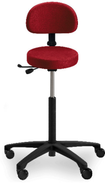
RH SUPPORT TABURETT