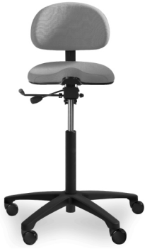
RH SUPPORT SADEL